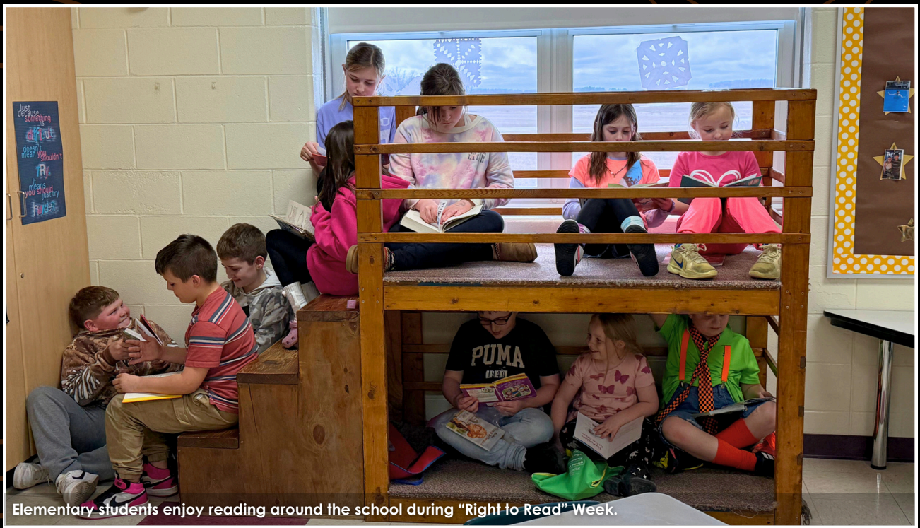
Elementary students enjoy reading around the school during "Right to Read" Week.