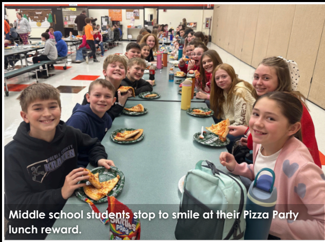
Middle school students stop to smile at their Pizza Party lunch reward.