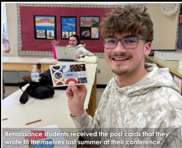
Renaissance students received the post cards that they wrote to themselves last summer at their conference.