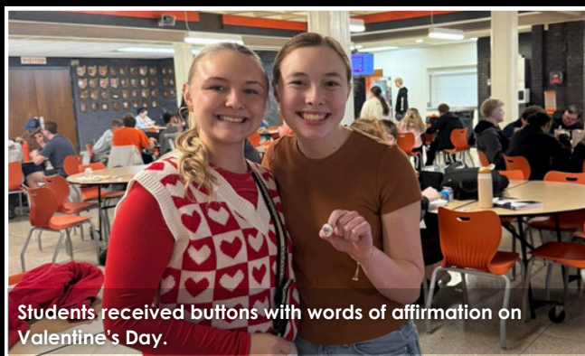
Students received buttons with words of affirmation on Valentine's Day.

Students conquered the 3 rd quarter, achieving at different levels. While the weather created record-level freezing temperatures, our students kept things fired up with a positive school culture! High school students hosted various games, activities, and a buffet-style breakfast for the staff during FFA Week. From reading around the school to finding success outside of the classroom, from becoming “word surgeons” to excelling as academic champions, our students represented our school well and showed why “it is better to be a Blazer!”