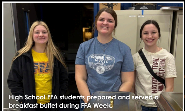
High School FFA students prepared and served a breakfast buffet during FFA Week.