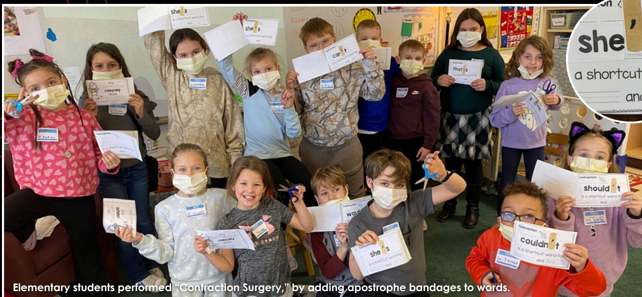
Elementary students performed “Contraction Surgery,” by adding apostrophe bandages to words.