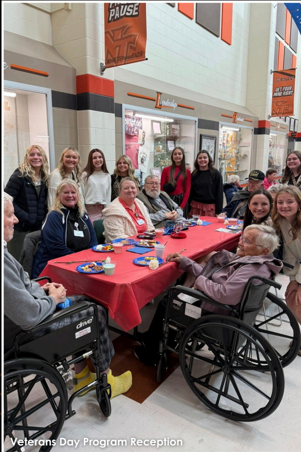
Veterans Day Program Reception

Our school was proud to honor our local servicemembers on Veterans Day with our annual program led by our 8th-grade students. Our middle school students also showcased their hard work and word power in the annual Spelling Bee. We kicked off the holiday season with our “Ice, Ice, Cookie” event, preparing cookies and sharing joy with local nursing homes and public safety departments. In addition, our elementary families came together for a warm and welcoming Family Reading Night, celebrating the love of stories and time spent learning together.