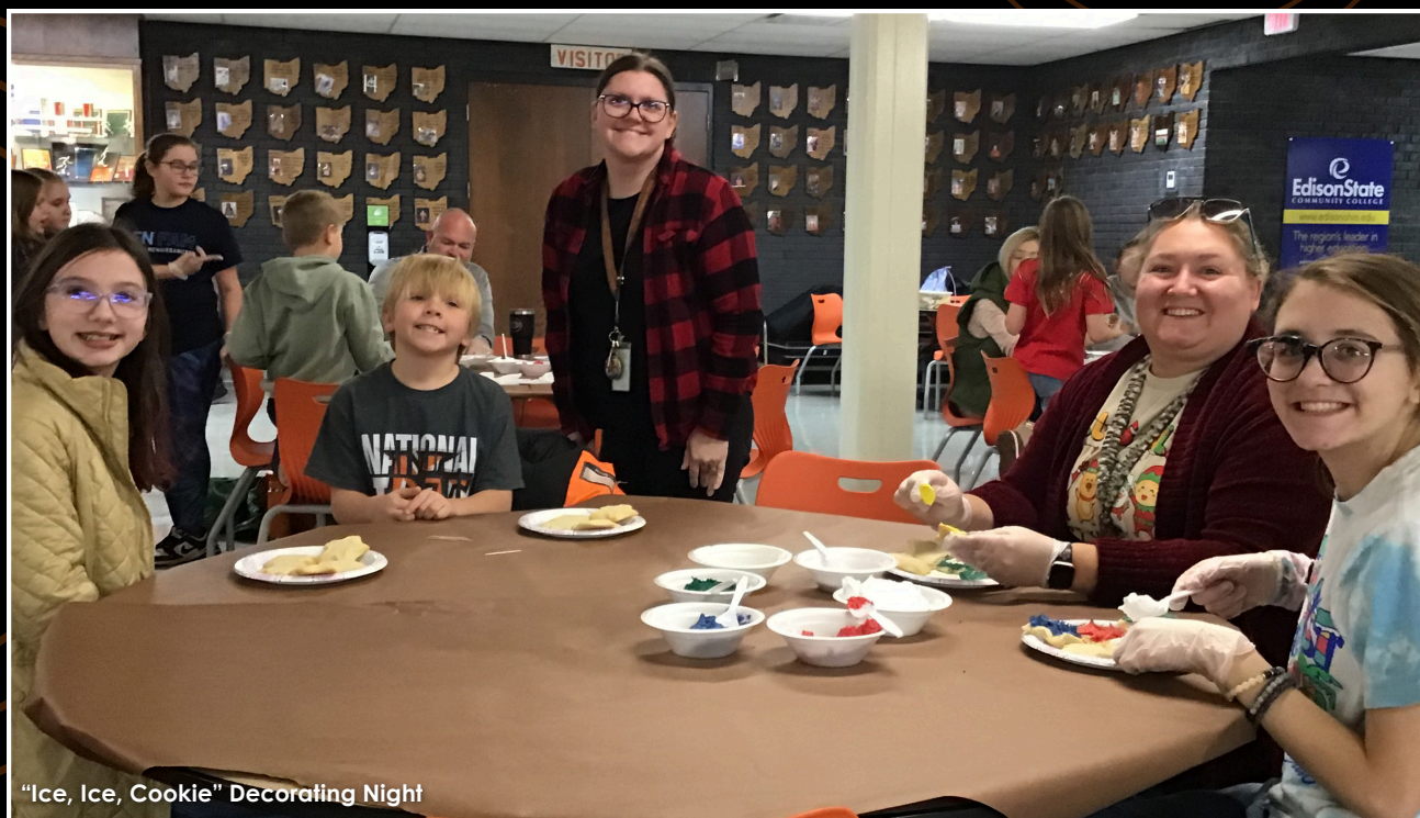
"Ice, Ice, Cookie" Decorating Night