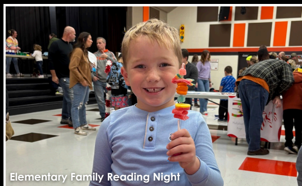
Elementary Family Reading Night