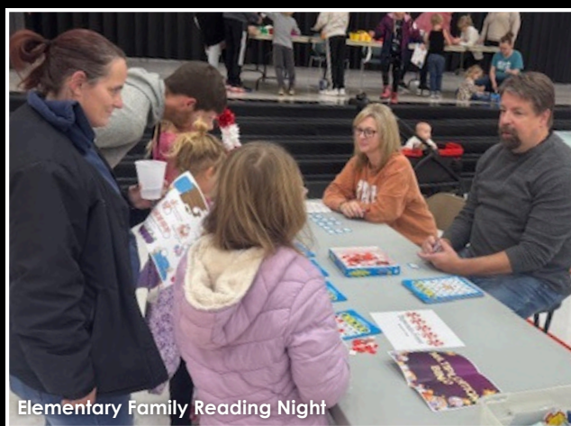
Elementary Family Reading Night