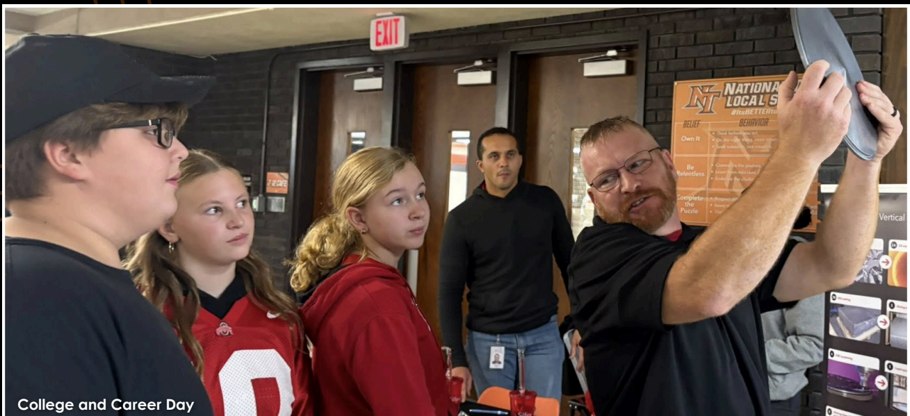
College and Career Day