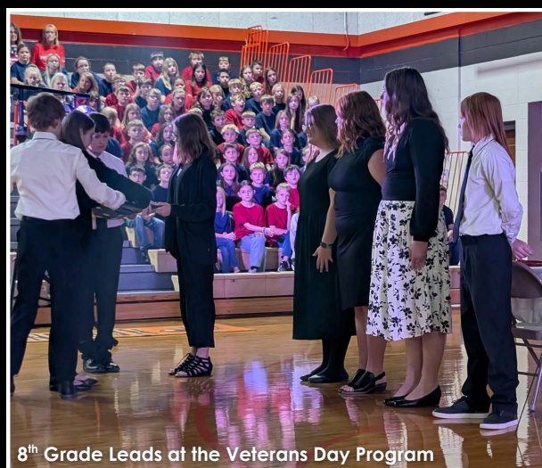
8 th Grade Leads at the Veterans Day Program